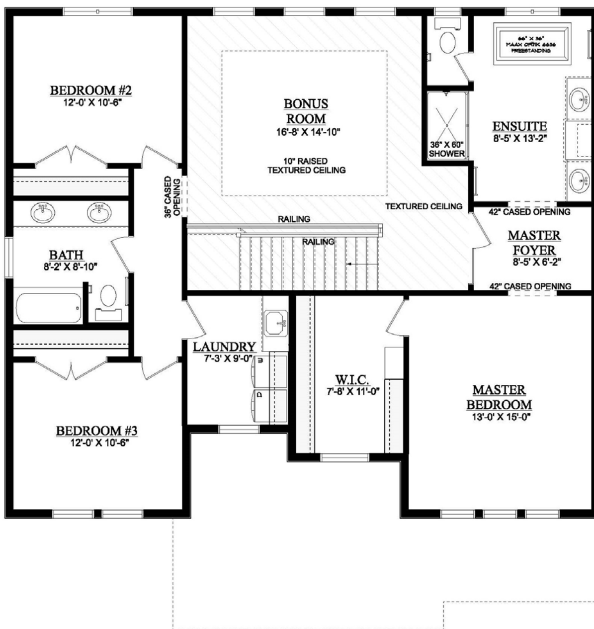
Upper Floor 1,438 Sq Ft

2,432 Sq Ft | 3 Bedrooms | 2.5 Bathrooms